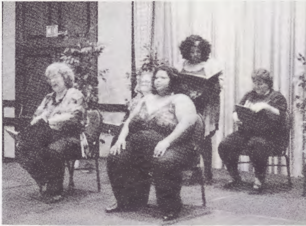
Fat Lip Readers Theatre was a highlight of the convention.