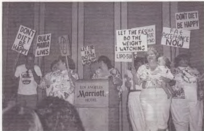
Grand finale: The San Francisco Bay Area Chapter treated us to their presentation of "Don't Diet, Be Happy."