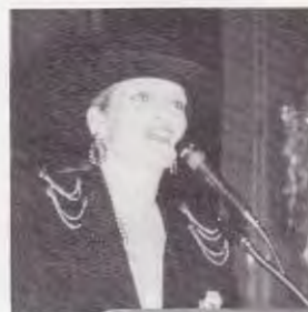
Idrea (CA) moderated the fashion show, which was followed by a trunk sale.

Exercise for the larger person, a workshop by Idrea, was just one of the many workshops held during the week.