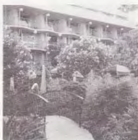
The tropical setting of the Marriott's pool area was a popular meeting place.

Sightseeing in Los Angeles, a national Board of Directors meeting, and registration were followed by parties in the hospitality suite and pool.